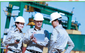
Port & Airport

PH600/PH660 is a cost-effective DMR radio with compact design, friendly UI, large battery, excellent sound quality, making it deployable in all commercial industries.